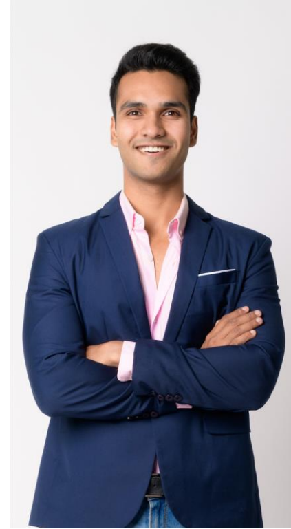
Business Decision Makers