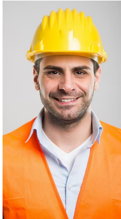
Vendors & Suppliers