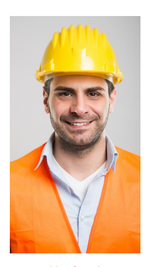
Vendors & Suppliers