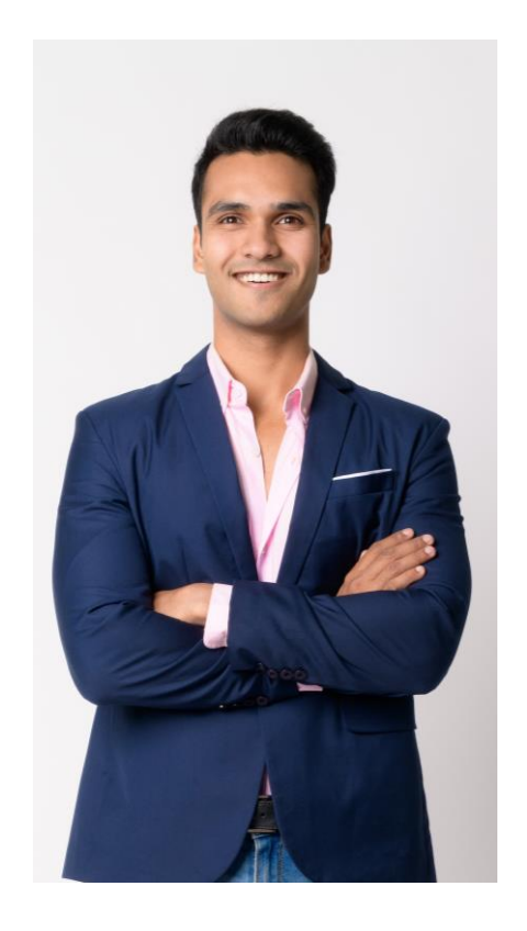
Business Decision Makers